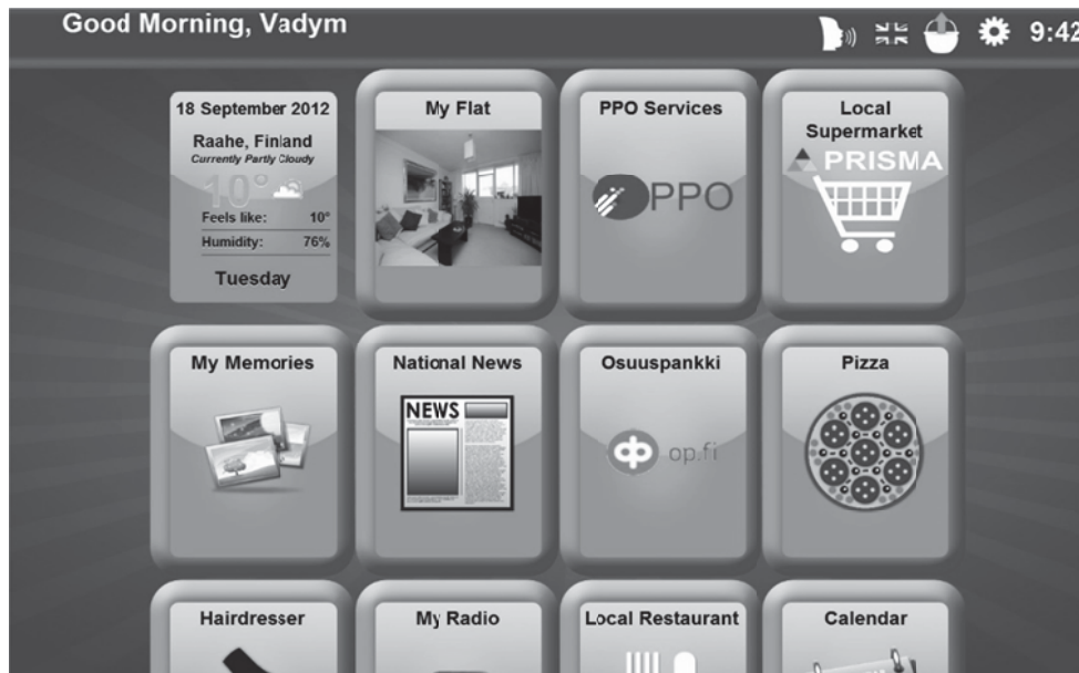
Fig. 1. Main View of the UbiHomeServer GUI

UbiHomeServer [6] is the implementation of the UHE serving engine developed by Oulu University of Applied Sciences (OUAS) group at PBOL. The UbiHomeServer offers a set of GUIs through which it is possible to interact with the UHE as well as consume and manage some of the ICT Home Services [5]. The UbiHomeServer operated GUIs offer similar user experiences regardless of a category of a terminal device and thus form an identical front-end of the UHE. A main view of the UbiHomeServer front-end is shown in the Fig. 1 [5].