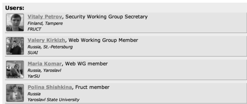
Fig. 3. Project members list

by sharing a document online with all the members. So the service, similar to Google Docs [17] should be integrated with the web site infrastructure. And it, by-turn, will come to some content organization changes.