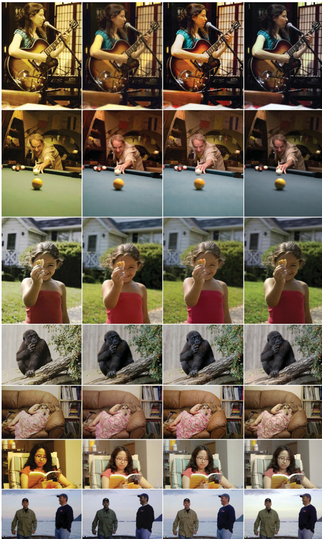
Fig. 2. Visual comparison of output for Exposure, LFIEM [23], MAXIM [24], and Our model (comboset) by columns