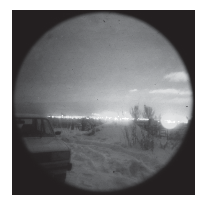
Fig. 1. Example of bloom effect in night vision device. The distance to light sources is about 1.5 \mathrm{km}

Vasili Kononenko SimLabs LLC Saint Petersburg, Russia vasily.knk@gmail.com