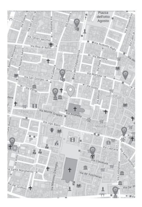
Fig. 3. Bologna attraction map

proactive recommendations. The proactive recommendations allows tourist to construct route through the selected city or region. The tourist can open the global map (fig 3) with all featured attraction and build a route to the selected point of interest with the help of the route service .