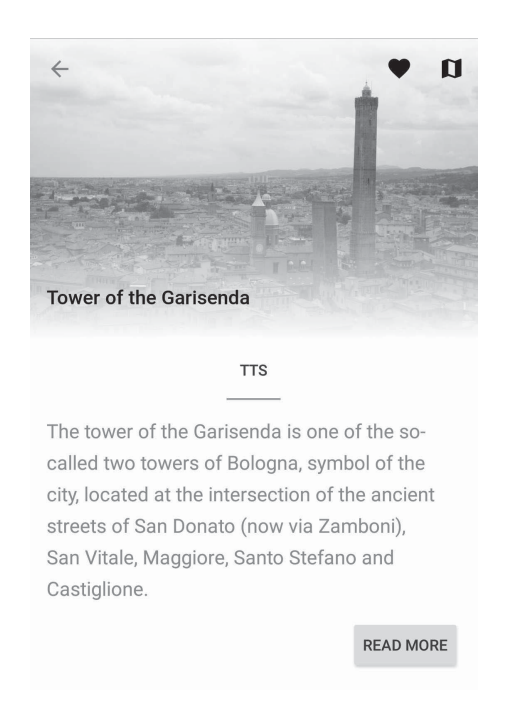
Fig. 2. Attraction description

For the current tourist position the application provides an image gallery and list of nearby attraction. With a certain periodicity the Android application updates the tourist location and displays of nearby attractions and also offers