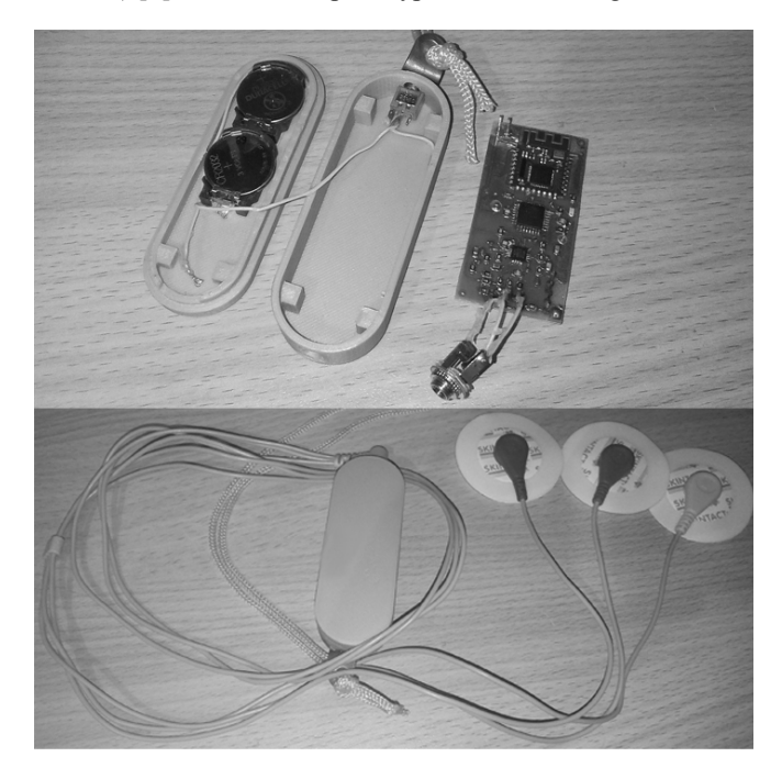
Fig. 2. ECG device prototype

Due to increased data transmission speed, it is possible to solve the problem with a pacemaker pulses in ECG signal by simply increasing the A/D Sampling rate to 2000 Sps (0,5 ms interval) [7]. ECG device prototype is shown in Fig.2.