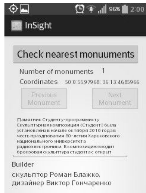
Fig. 2. In Sight – description