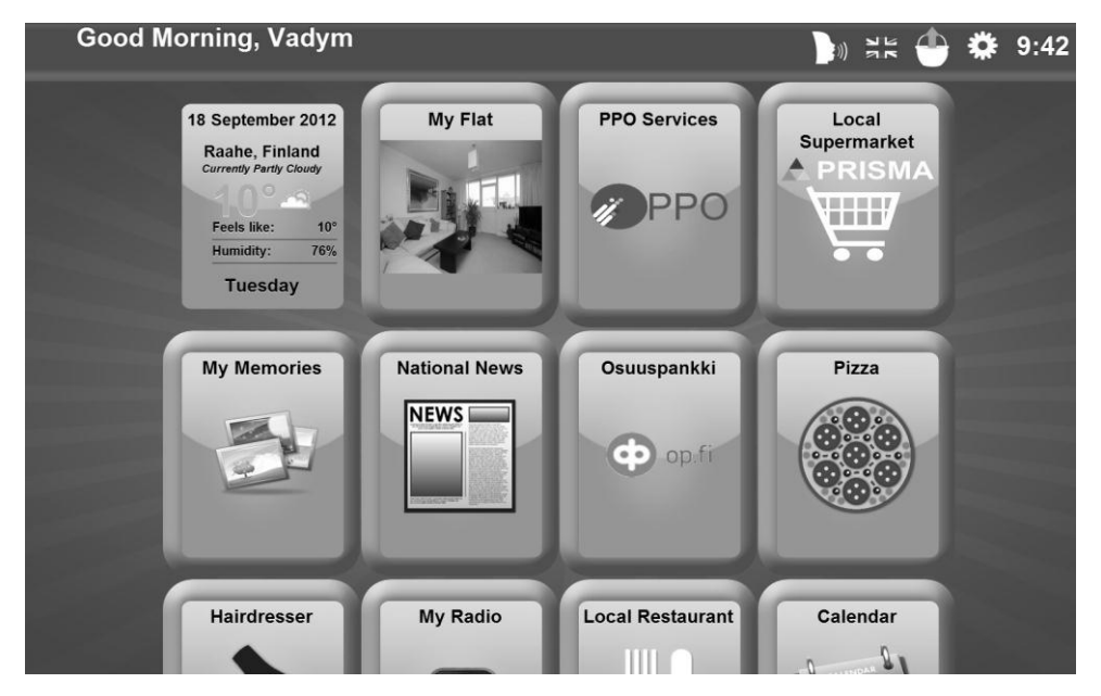
Fig. 2. Main View of the UbiHomeServer GUI

The UbiHomeServer operated GUIs offer similar user experiences regardless of a category of a device and thus form an identical front-end of the UHE. A main view of the UbiHomeServer front-end is shown in the Fig. 2.